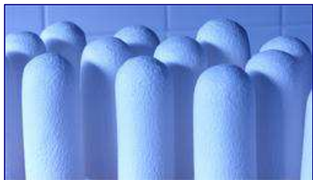
Our cellulose thimbles

Frequently used in Soxhlet, Tectator extractors or similar type extractors. Located in the inside of the extractor body, used to accommodate a sample of solid material from which some component must be separated by the addition of sufficient solvent.