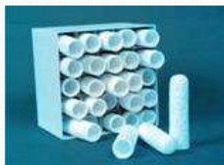
Glass microfiber thimbles

Our glass microfiber thimbles are made of borosilicate glass fibers that are 100% free of bonding agents.